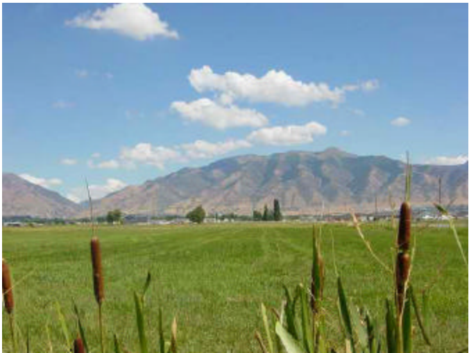
Logan Peak on a beautiful summer day