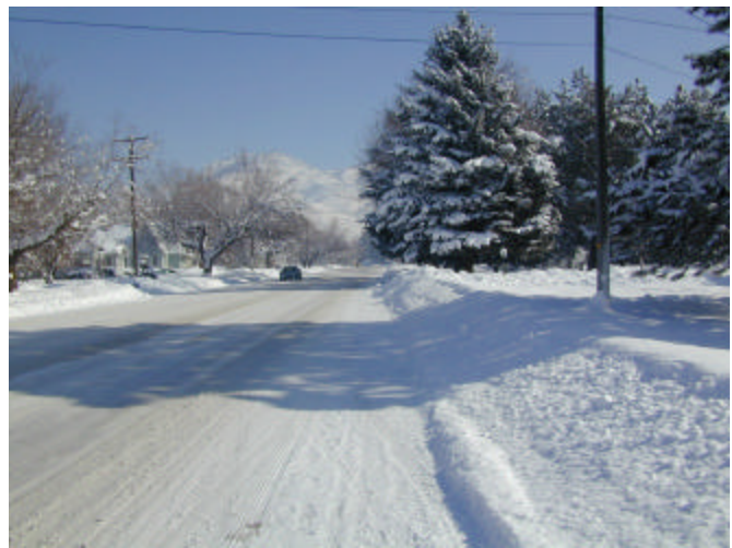
A street in Smithfield on another kind of beautiful day

The Bridgerland Amateur Radio Club meets the second Thursday of each month at 7:30 P.M. at 113 East Center Street, Hyde Park Utah. This is the Hyde Park City Hall. The club does not meet during June, July, or August. Activities usually fill these months. Anyone interested in amateur radio is welcome to attend. Please join us. Talk in on the 146.72 repeater.